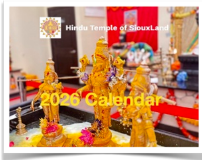
2026 HTOS Calendar

https://hindutempleofsd.org/2026-htos-calendar